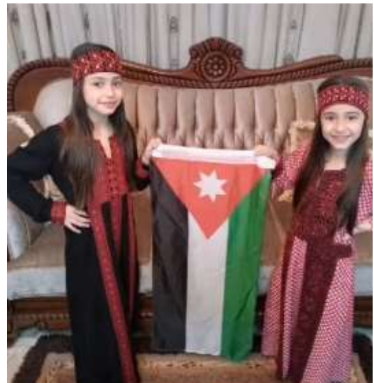
The children celebrated the 75th anniversary of independence, also from home.

Many of you support the school beyond the membership fee. We are incredibly grateful to you for this. The corona year 2021 particularly challenges us and we always look forward to your donation. It benefits the school without any deductions and is fully tax deductible.