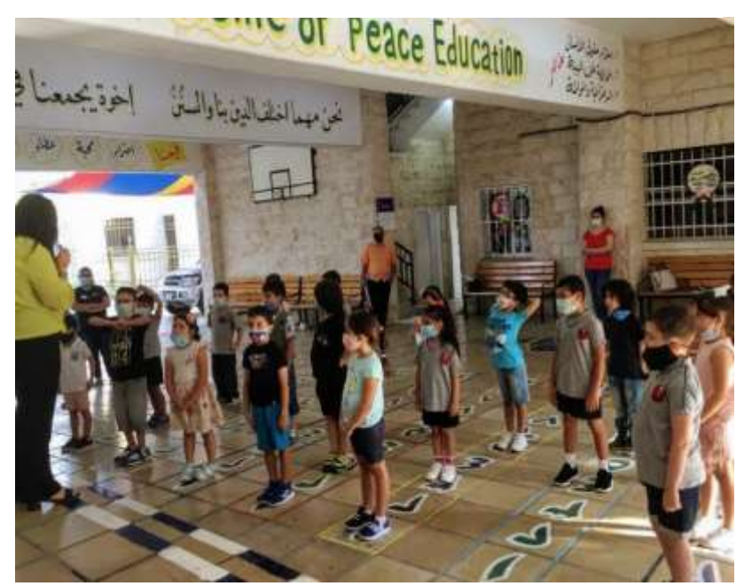
Morning Roll Call under Corona Conditions

After a promising start it should turn out that we would face one oft he most challenging times in the school's history. Shortly after opening the school after the summer break we - as all schools in Jordan - had to close because of the corona epidemic. Classes are being taught in part digital as distant learning. Especially in our situation this is extremely challenging.