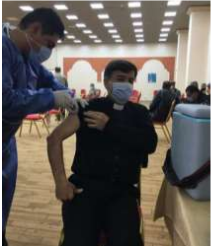
The vaccination had become compulsory for all teachers.