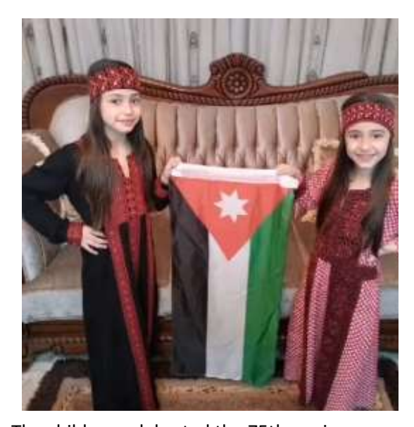
The children celebrated the 75th anniversary of independence, also from home.

Many of you support the school beyond the membership fee. We are incredibly grateful to you for this. The corona year 2021 particularly challenges us and we always look forward to your donation. It benefits the school without any deductions and is fully tax deductible.