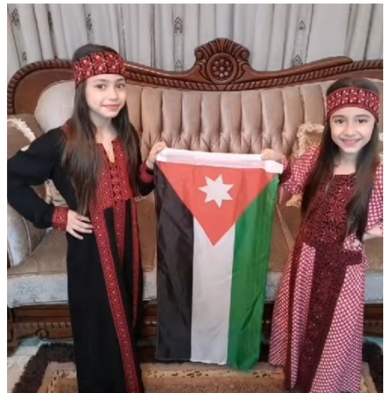
The children celebrated the 75th anniversary of independence, also from home.

Many of you support the school beyond the membership fee. We are incredibly grateful to you for this. The corona year 2021 particularly challenges us and we always look forward to your donation. It benefits the school without any deductions and is fully tax deductible.